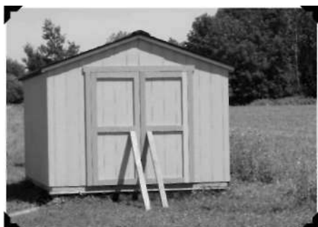
Our new shed