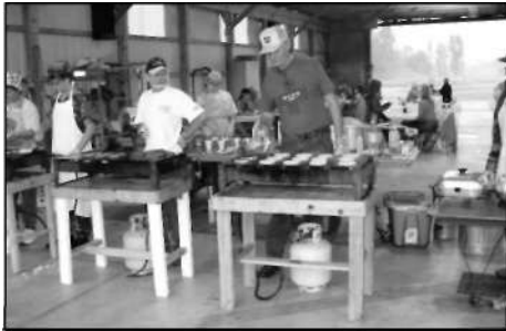
An inviting menu.

The knights were asked to set up a static display in the hanger.