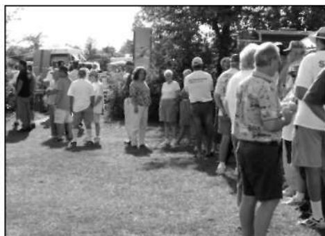
Pilot's dinner line

On Saturday, around noon, open flying was suspended for a brief time while several special aircraft and performances could take place.