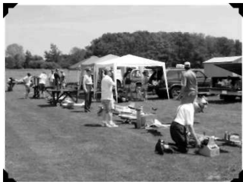
Crowded flight line

A good number of Knights took advantage of the ideal conditions to come out to the second picnic of the season.