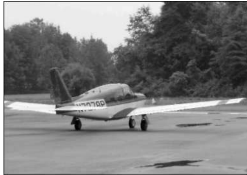
Cleared for take-off

At least 30 people took advantage of the opportunity to enjoy a flight around the Lake View area.