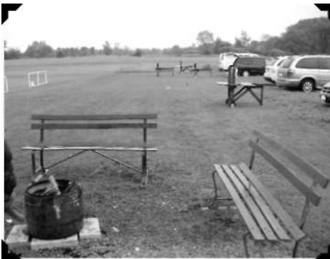
Where did they go?