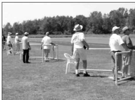
Crowded flight line

Blessed with good weather, the pilots took full advantage of every moment.