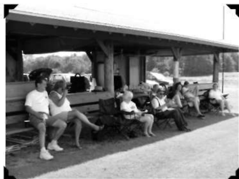
Shady vantage point

Several of our new members couldn't pass this opportunity up.