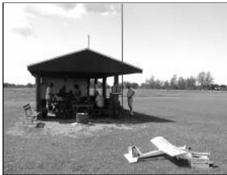
A very windy day.