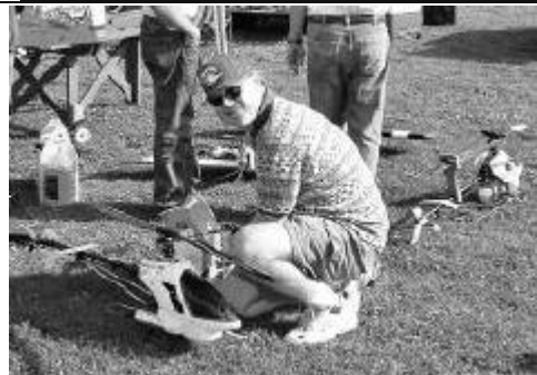
Wings are for wimps