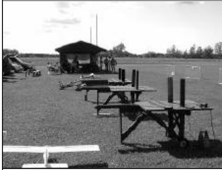
Grounded by the wind.