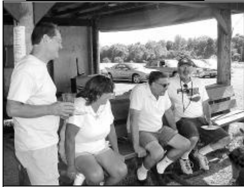
Won't 4 o'clock ever get here?