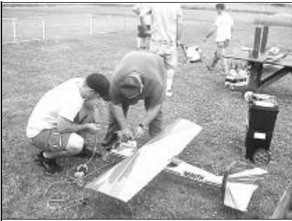
Planes have to eat, too.

Our picnics turned out to be great, drawing a record number of members and their families out to the club field in North Collins.