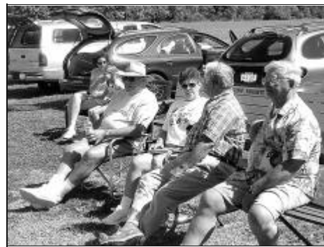
When you can't fly, you talk.