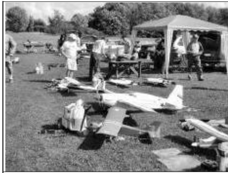
Crowded Flight Line