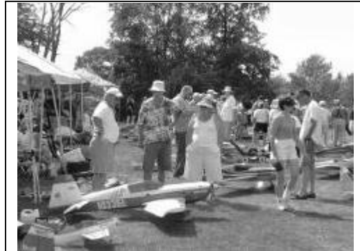
Spectators examine air show planes

Sunday morning came with continued beautiful weather. All day, at least four planes filled the air.