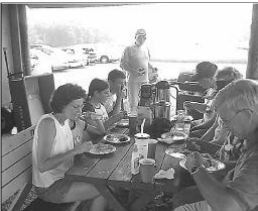
The best part of the day.

It seems that nearly every day was bright and sunny and the winds were calm and forgiving.