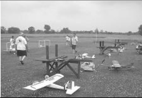
The flight line starts to crowd up.