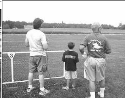
Scout tries hand at flying.