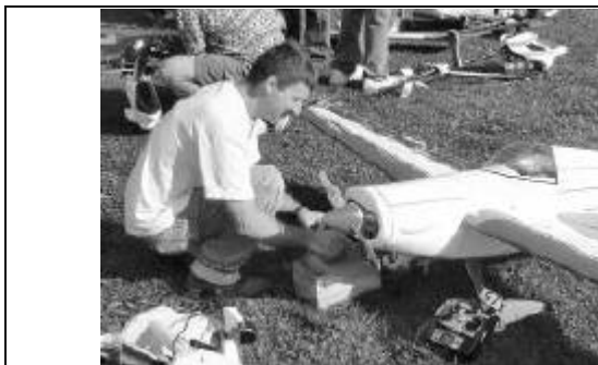
Can't pass up this great weather.