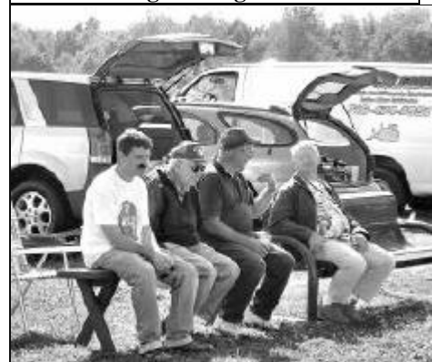
To fly or not to fly, that is the question.