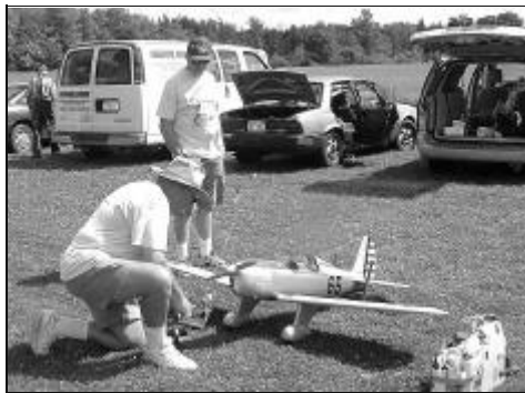
No guts, no air medals!