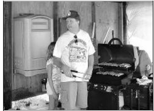
Maybe you'd like to wear it!