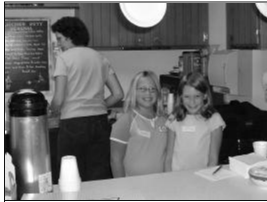
Pizza anyone? Coffee, donuts...

It was a brisk pace, with many fine items passing under the gavel.