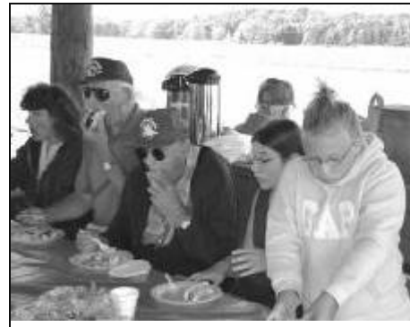
Just can't get enough of this stuff.