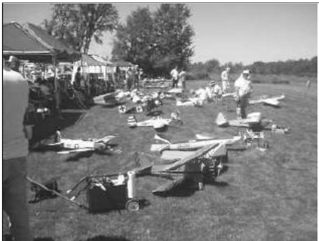
Awaiting air time at last years rally

In addition to the flyers, the manufacturers must also be contacted