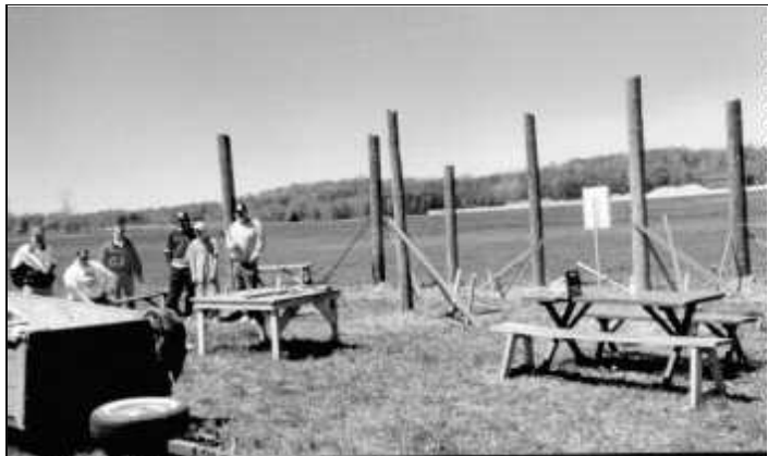
Waiting for the trusses