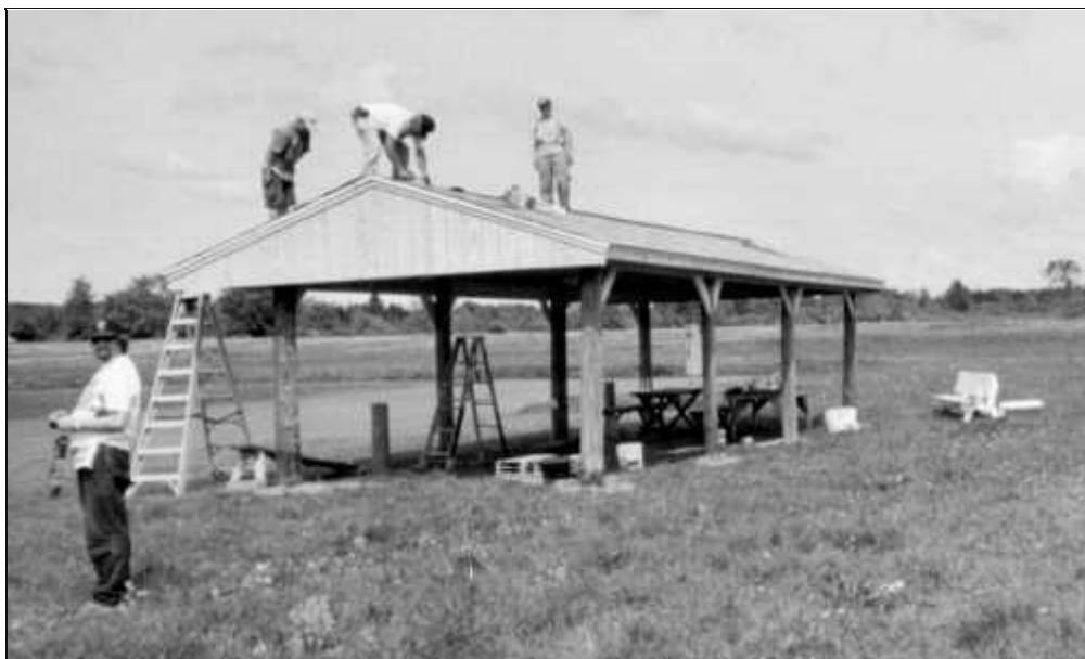
Adding the finishing touches