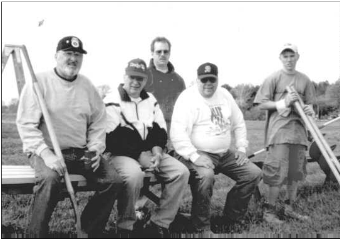
Some members of the Shelter Crew take a needed break.