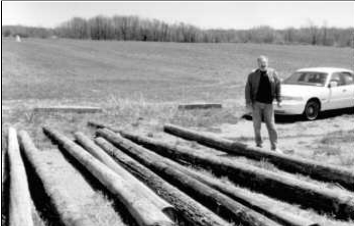
Arrival of poles

So it was decided that I go 57 miles round trip to get an extension. When I returned, Dave and Greg had dug (5) holes, 4 feet deep, just to keep busy.