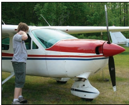
So, That's how it works.

Perhaps next year a new subject aircraft can be chosen for a similar program.