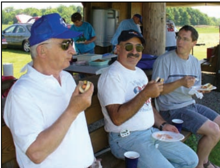
A tasty break

There will be other picnics this year, but June's picnic will be a hard one to beat.