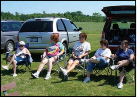
Flying, heck! Let's talk about dinner.

Somewhat more than a dozen Knights took full advantage of the superb conditions to ring out their planes.