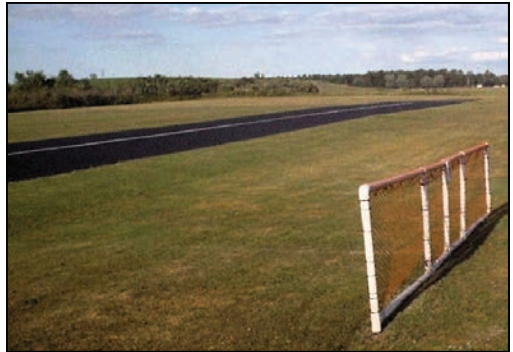
Nike Base Runway

The most significant argument put forth, was that model flying and soccer cannot co-exist because of the threat of injury from a wayward model.