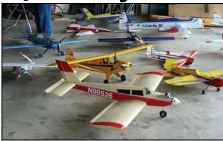
Knights static display

From a couple of Cherokees to a beautiful large scale B-25, the array consisted of variety of models flown by our club members.