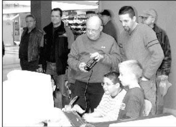
Future pilots hone skills on simulator

Thanks to the participation of so many knights, this years show was another great success.