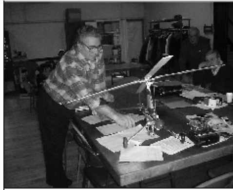
Orv demos "Arse Over Tea Kettle" gadget

It easily locates the "horizon" and deftly puts the airplane (or helicopter) right side up.