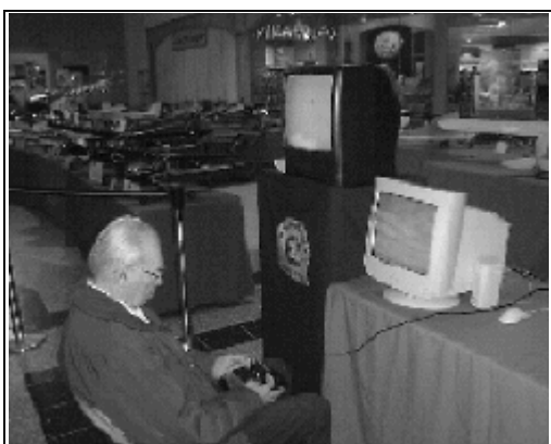
Flight Simulator at Mall Show

Over all the show was a great success, and now the Knights will take all of these great looking planes and head for the flying field. Many of them will not survive the summer, but you can be sure that when the nights grow long again and the autumn winds start to howl, the Flying Knights will retreat to their basements and begin the building cycle all over again, crafting a new crop of planes for next years mall show.