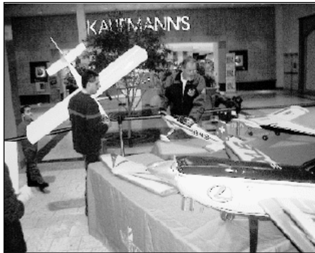
Setup on Thursday evening

There seems to be a need to show every one the results of your handiwork and what better venue to display