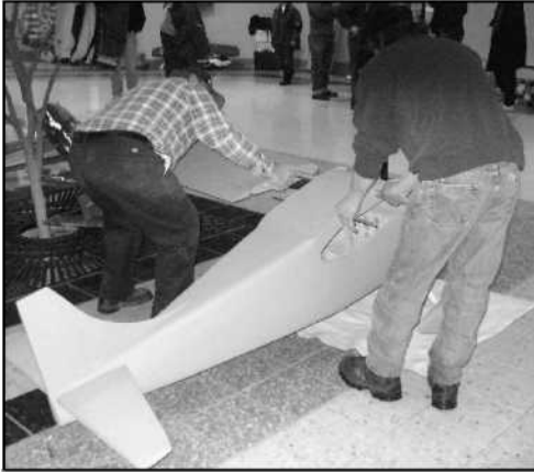
Assembling the Cessna

Our annual mall show is a big hit with all age groups.