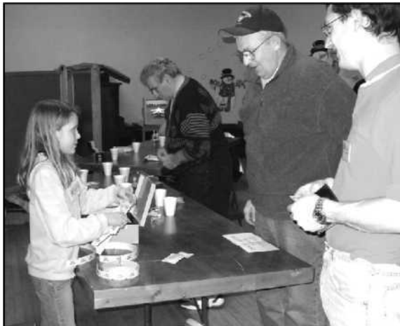
Eager customers que up to buy tickets

The proceeds of the Chinese auction are used to help pay for projects at the North collins site.