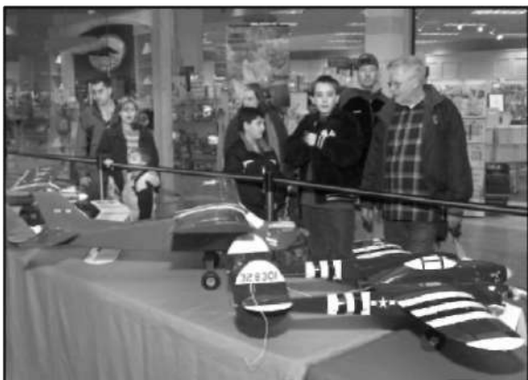
Spectators scope out display

It was unique, in that the control directions did not change as it rotated.