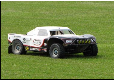
When the planes are grounded...

Our next picnic is planned for the new Emerling field.