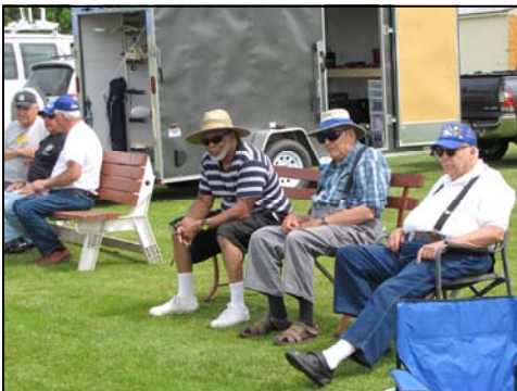
Enjoying conversation while waiting out wind.