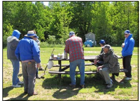
Meeting to plan cleanup