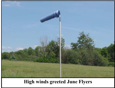
High winds greeted June Flyers

Each month during the summer a Sunday picnic is scheduled at each of our flying fields. Shelters and facilities have been provided at each field to make the venue as comfortable as possible. Some of these projects are still being worked on.