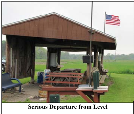
Serious Departure from Level

The chances of another November storm are probably pretty slim, perhaps once in hundred years, but like the proverbial coin toss, it could be next year.