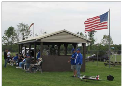
National Aviation Day of 2014

The event has been extremely successful in helping the Wounded Warriors with a substantial contribution.