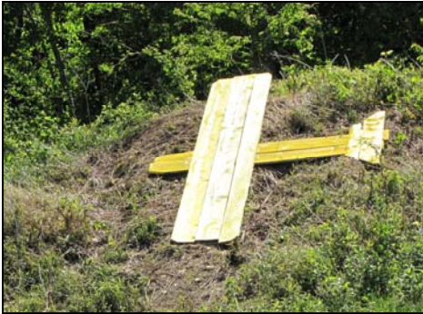
Aircraft Icon at Emerling

That being said, the flight stations were put in place and everyone enjoyed flying during the afternoon. -----