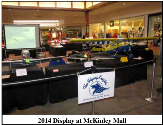
2014 Display at McKinley Mall

One of the features of our mall show is the interaction with the spectators. People can ask questions of our members on almost anything aerodynamic as they peruse the models.