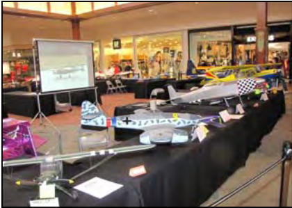
A Wide Variety of Flying Machines

Providing young people with activities is an excellent contribution to our community.