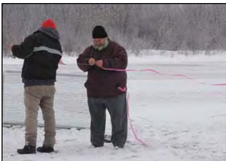
Preparing for Mortal Combat

Always, a cold and blustery scenario, it never fazes the more adventurous of fliers.