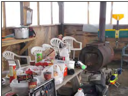
Warm & Cozy Dining Room

It was a fun event and despite the cold everyone enjoyed this break in the winter doldrums.