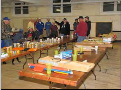
Working Down the Line

The Chinese auction was originally instituted to provide funding for improvements to our flying fields.