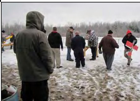
Crowd hits the Frozen Flight Line

Of course the more sane fliers came out as well and there was a fine showing of helicopters and pattern aircraft.