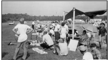
Third Annual Meet June 26, 1966