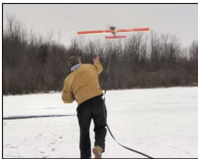
Launching for combat

Inside the shelter the wood stove radiates a copious amount of heat.