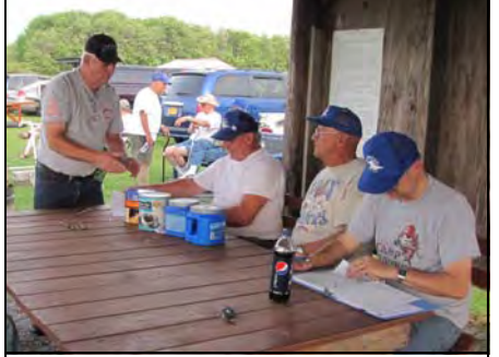
Business as usual

Business was conducted in short order and flying resumed until dusk.