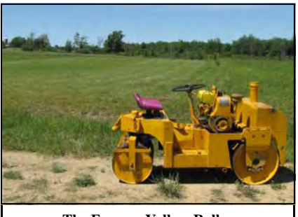
The Famous Yellow Roller

Being farmland, it is in rough shape with high and low spots.