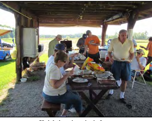
Knight's enjoy picnic fare

Unfortunately something went awry as he crossed the north end of the field. A search party was dispatched.