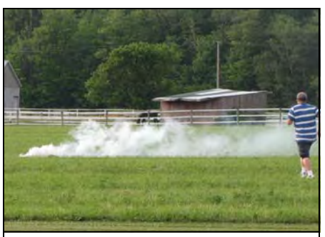
Lipo battery -1, Flyer- 0

With the encroachment of other activities at the Nike site, this meeting venue was severely curtailed until it was eventually abandoned.