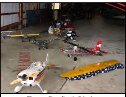
Hanger Bay Static Display

Many of us with grey hair can remember the airport on Camp Road