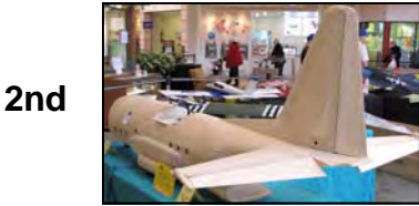
Orv Chatwood “C-130”