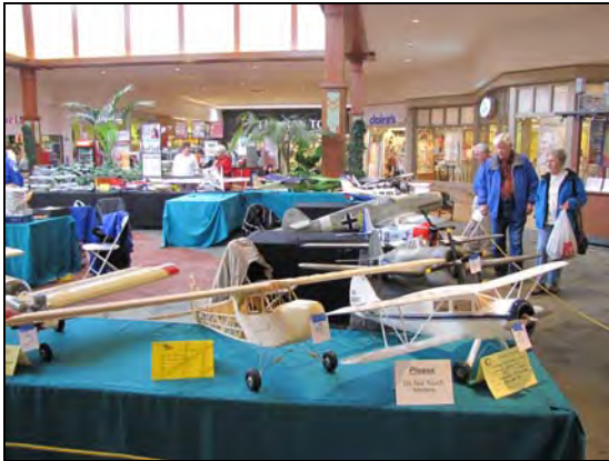
Patrons look over Mall Display

The winter projects have been completed and everyone is eager to show off their work.