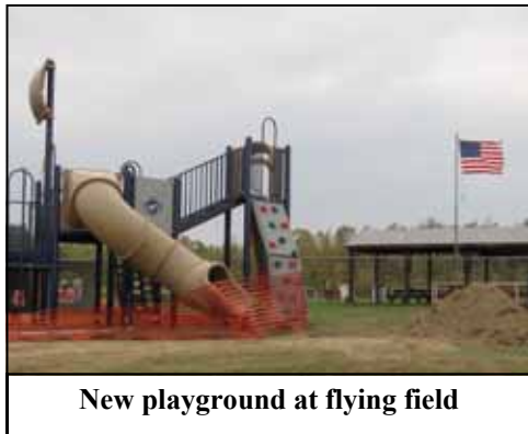
New playground at flying field

At all other times, there is a sign posted that informs all visitors, (including those with children), that they are to stay behind the fence for safety reasons.