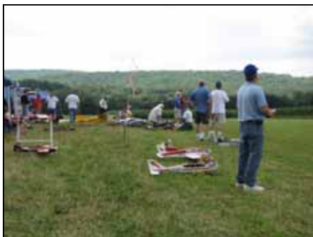
Hill Top Airfield