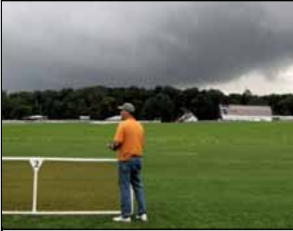
Storm clouds approach

At 4 PM the rain came. The planes disappeared from the flight line, as frantic flyers sought temporary cover for their machines.