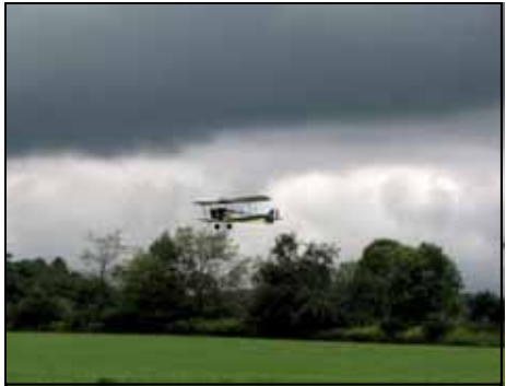
Returning before the storm

As soon as the rains came, the food was ready.