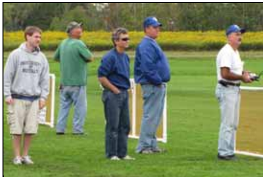
Sometimes it takes a group to land a plane

And a nice summer it was. Few could complain about the number of flying days.