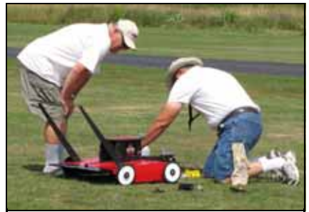
Tuning the Flying Lawn Mower.