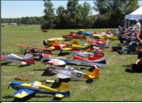
Gentlemen! Start your engines.

At the end of the day, the pilots gather to share in the Pilot's raffle.