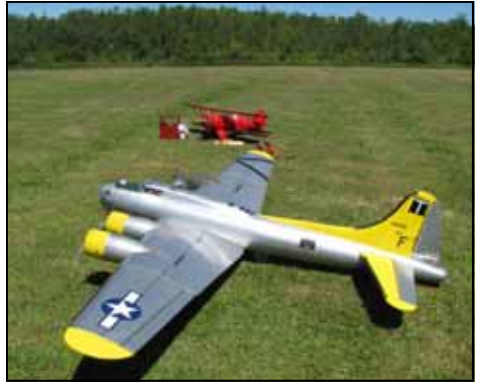
B-17 readies for take-off

This is a very popular part of the Rally. For about 15 minutes or so, people can get a close up view of the planes they see flitting about in the air above them.