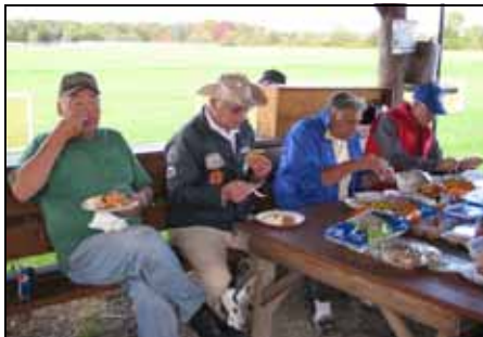
Dinner trumps flying

Thirty two knights and family came out to North Collins to take advantage of the last picnic.