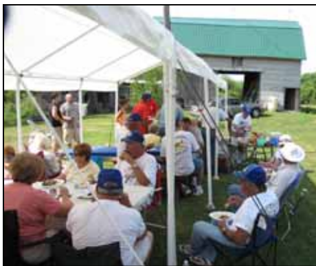
Enjoying the Barbeque

But, the flying was superb and the weather was perfect.