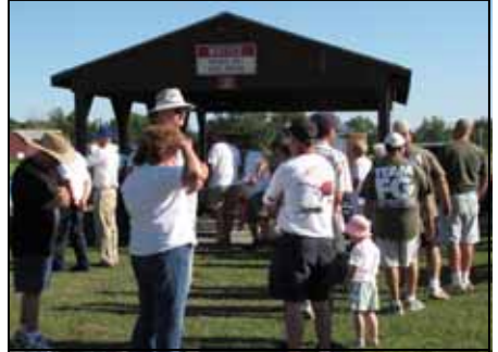
Line forms for Pilot's Dinner

There are always fewer pilots on Sunday but 44 flights were put in, particularly in the middle of the day. Around 3 PM the pilots are eager to get on the road. Many have come from distant locations and prefer to be well on the way home by evening. The Pilot prize for Sunday is also $100.