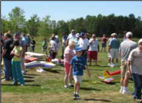
Enthusiastic crowd surveys field.

The first winner receives a $100 cash prize. Each subsequent winner chooses from among the many donations made by supporting manufacturers.