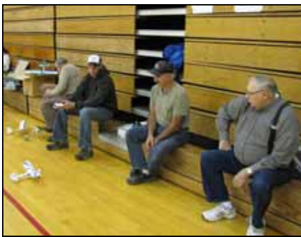
Knights working out at the Gym

One side of the gym is reserved for electric helicopters. It's amazing