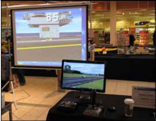
Ready for Prime Time

Both our videos and pictures can be taken to other places that request an educational visit from the knights, especially schools or