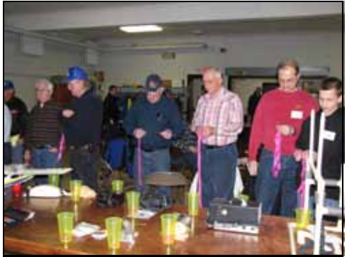
Customers swoop on auction items

No matter how you try to control it, stuff seems to naturally fill all the