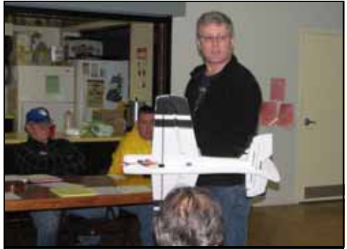
Bill demonstrates principles

For pilots of full scale aircraft, there is both putting in flight time and going to ground school.