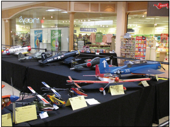
Display table at Mall

The mall show provides our club with a means to interact with the