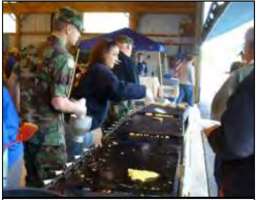
Civil Air Patrol serves breakfast.

annual event and the pancake breakfast alone is a good reason not to miss it.