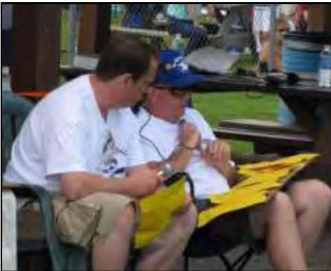
Announcers try to unscramble flights

Sunday morning did not bode well for the 2009 Rally.