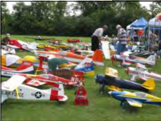
Crowded Flight Line