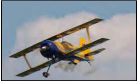
Ultimate biplane, field center.

Cool WW1 biplanes sat amid Bombers, jets and sleek acrobatic models. Each was a replica of an actual airplane.