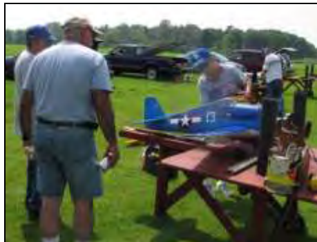
Getting ready for flight