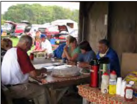
Time out for dinner

More pictures of our summer picnics for July and August are displayed on the page 6.