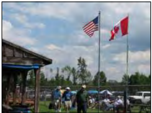
An International Event