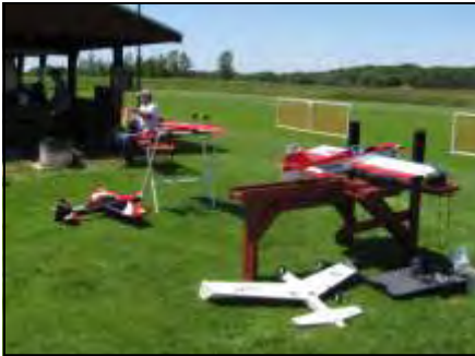
July Flight Line

August picnic: Great weather, poor crowd.