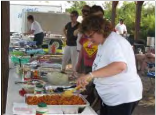
Cooking up the Pilot's Dinner

Flying continued throughout the afternoon .