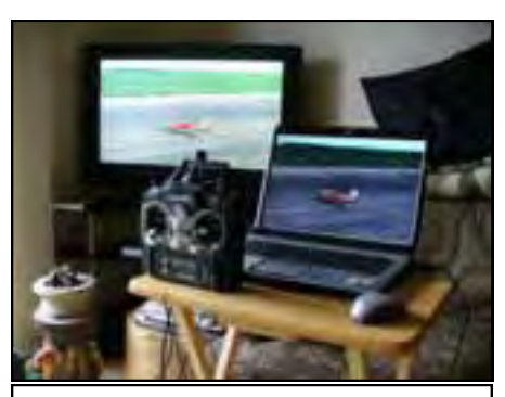
Digital TV Simulator.

Of course, it is best to check the connectors and be sure that you get the appropriate cable for your particular devices.