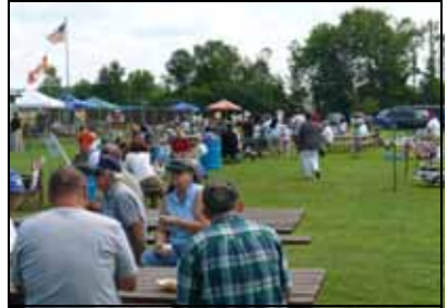
Spectators enjoy a lunch break