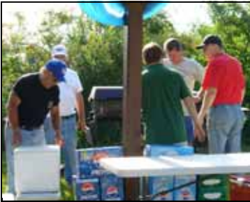
Food tent conference