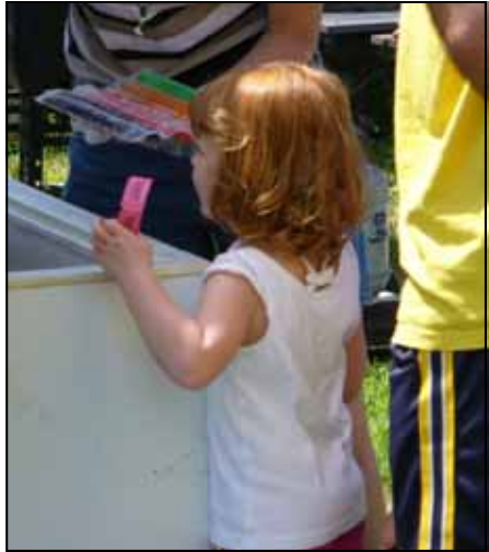
One ice cream, please, sir