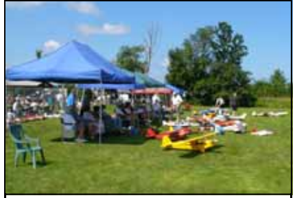
Planes to the Left