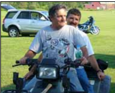
Getting around the easy way