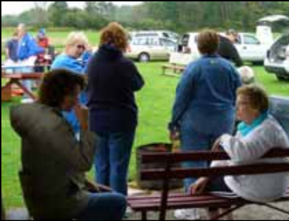
Thoughts from the other side...