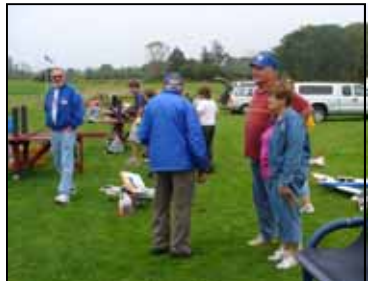
Browsing the Flight Line