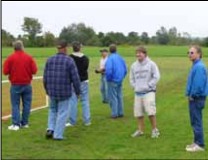
If words could fly planes...