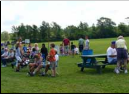
Watching the flight antics