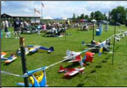
Sunday's static display