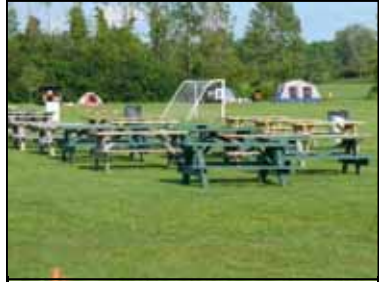
Benches need to be placed