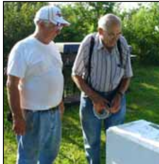
Solving the Cooler Crisis