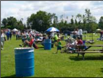
A fine Afternoon