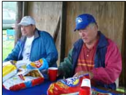
Even the snacks aren't safe