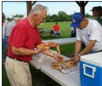
Reward for all the hard work