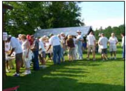
Pilot's Dinner at day's end