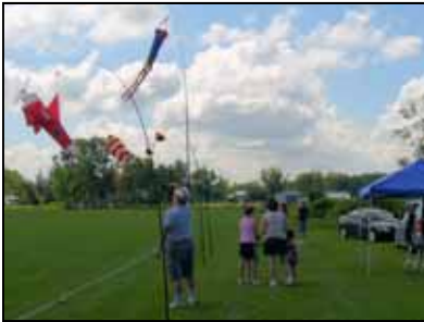
Les Hank's Kite Station