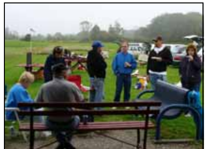
Enjoying the "Dinner Break"