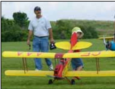
Pit crew brings plane to line