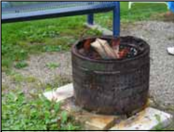
A cheery fire cuts the chill