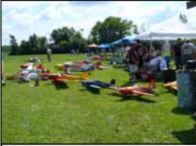
Planes to the Right