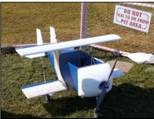
New design readied on flight line.

The plane was repairable and of course, there was a back-up model.