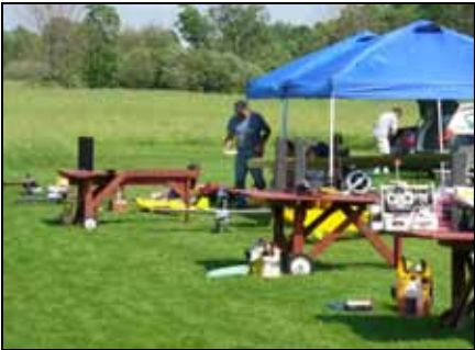
The view down the flight line.