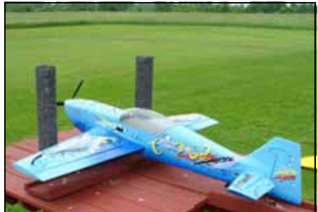
All dressed up and ready to go.

All in all, it was a most pleasant day for a picnic.