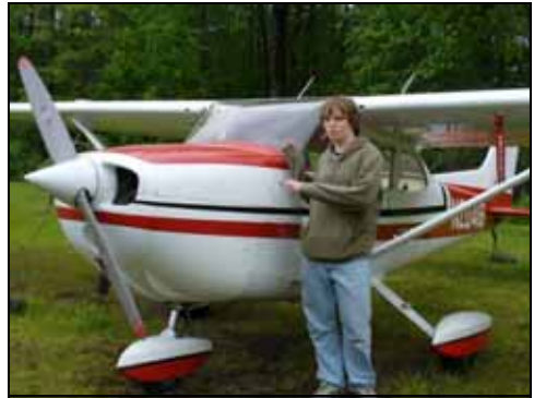
Cessna gets checked out by patron

Perhaps, next year the weather will be more cooperative and full scale flights will be available.