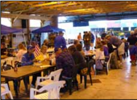
Breakfast in the hanger

The disappointing weather canceled the airplane rides due to a severe crosswind on the runway. Landings are risky under such conditions.