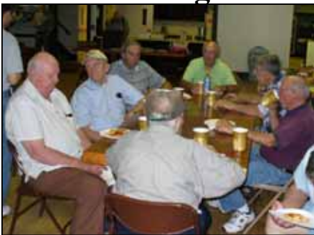
Our guests enjoy pizza.

It must also be something that is affordable and convenient.