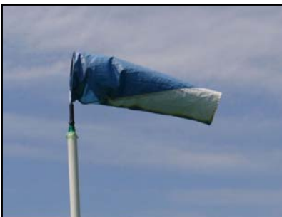
Windsock tells the story.