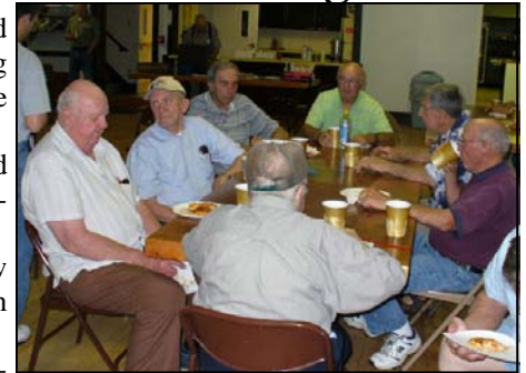
Our guests enjoy pizza.

It must also be something that is affordable and convenient.