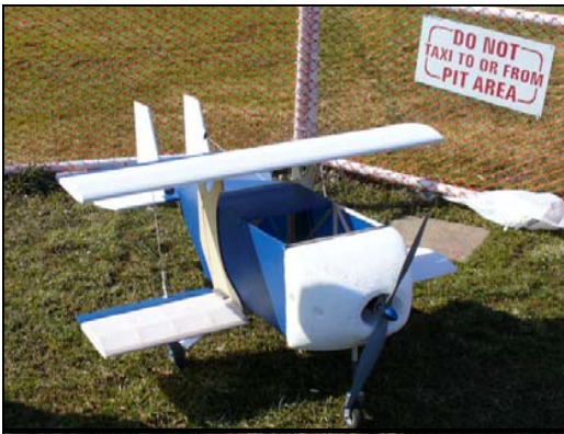
New design readied on flight line.

The aircraft must take off within 75 feet and must complete a 360 degree circle.