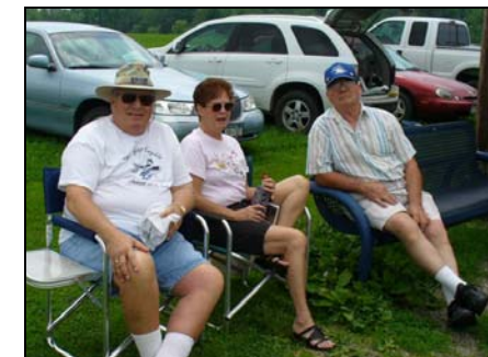
Flying is also a spectator sport.