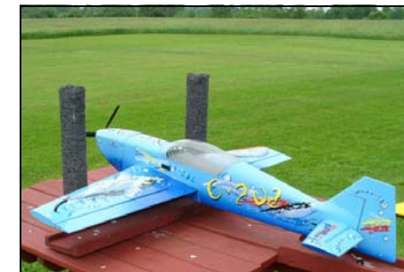
All dressed up and ready to go.

George Fox fired up the grill at the appointed time and everyone quickly went into eating mode.