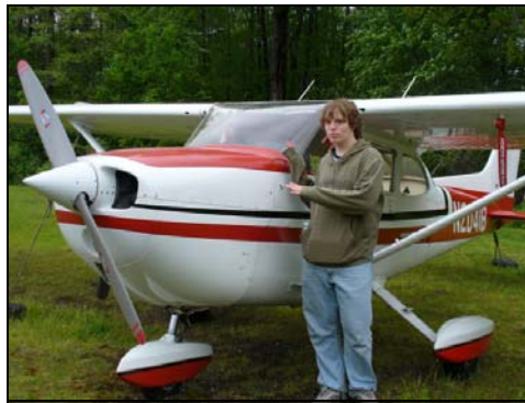
Cessna gets checked out by patron

Perhaps, next year the weather will be more cooperative and full scale flights will be available.