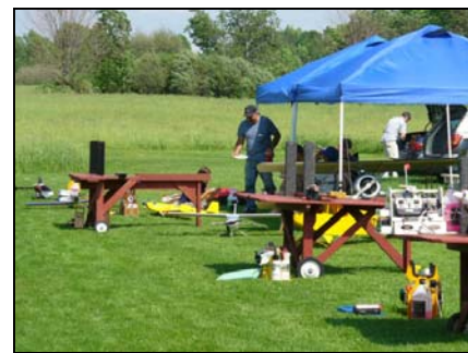
The view down the flight line.

George Fox fired up the grill at the appointed time and everyone quickly went into eating mode.