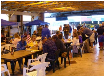
Breakfast in the hanger

The disappointing weather canceled the airplane rides due to a severe crosswind on the runway. Landings are risky under such conditions.