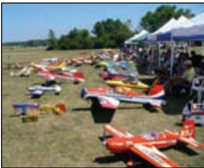
Let the flying begin!