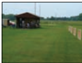
Hello! Anybody home?