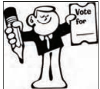
At November's meeting, nominations will be called for.

Consider seriously if you or someone you know would like challenge our incumbents or fill any vacancies that may occur.