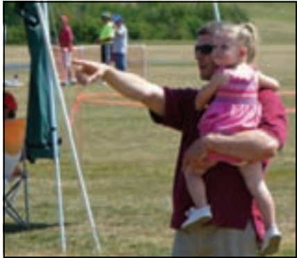
Wow!, Did you see that!

Sunday was a virtual replay of Saturday. Outstanding weather with minimal winds set the tone for the day.