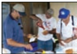
Recipe for disaster!