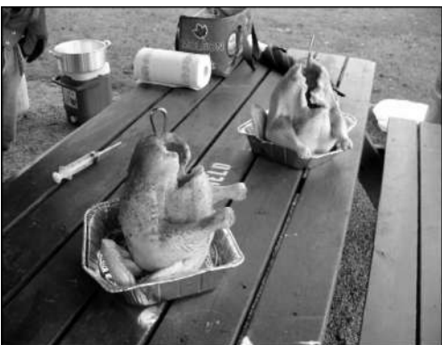
Impounded turkeys await their fate,

Although the rain, never heavy, yet always present cast a gloom about the day, it was offset by the warmth, the comradery and the good food.