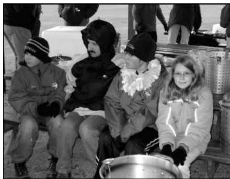
When will those turkeys be done?

Soon peanut oil and cookers arrived on the scene. Other knights materialized as the dreary afternoon wore on.