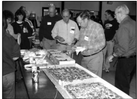
Lining up for pizza

The pizza arrived on schedule and piping hot. There was a lot to talk about.