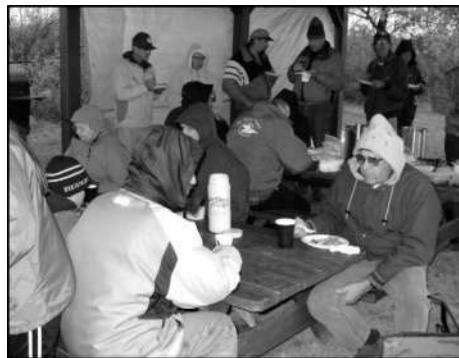
Ahh. Dinner at last.

Everyone filled their plates with the superb dishes brought to pass. An array of excellent desserts topped off the fare.