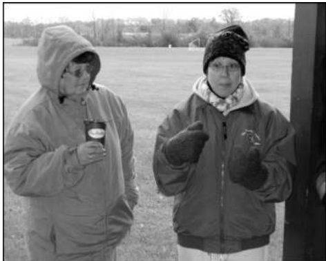
Coffee and gloves are order of the day

It all came together on the 22nd of October.